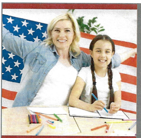
Recognize teachers who care about America!

Based on the nominees submitted, VFW chapters, called Posts, will recognize teachers in the following categories, K-5, 6-8 and 9-12. Posts then submit these winners' names and required documents to their District-level judging, if applicable, who will forward their winners to the Department (or state) level. After judging, each Department then forwards their winners to VFW National Headquarters for consideration in the national awards contest.